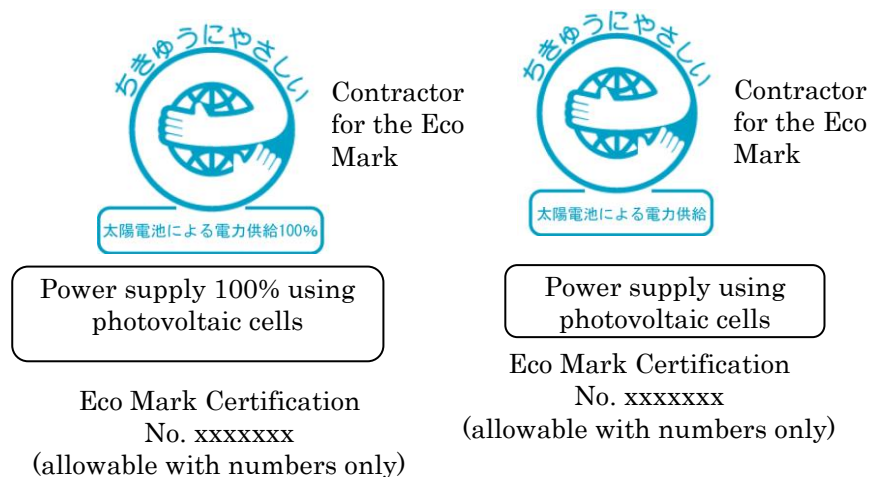
Figure 2 Example of Eco Mark Display